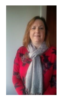
Murmerings from the Manse

What is the sign that makes men great? M The royal crown – the brandished sword? A The power to make men leap to serve – U The threatening of a tyrant's word?